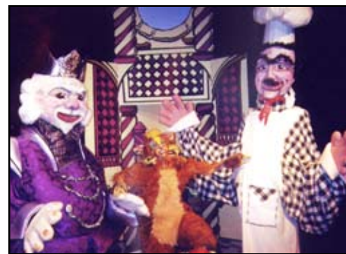
Bits 'N Pieces Puppet Theatre

The performance is sponsored in part by the State of Florida, Department of State, Division of Cultural Affairs, the Florida Arts Council, and the National Endowment for the Arts.