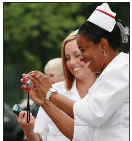
NFCC's commencement ceremony was a special moment for many graduates.