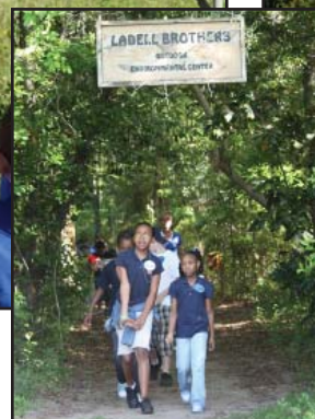
Students also visited NFCC's Ladell Brothers Outdoor Environmental Center during Ecology Day.