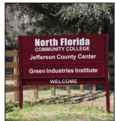
Green Industries Institute is located at 2729 West Washington Street in Monticello, three miles west of the Monticello Courthouse on U.S. Highway 90.