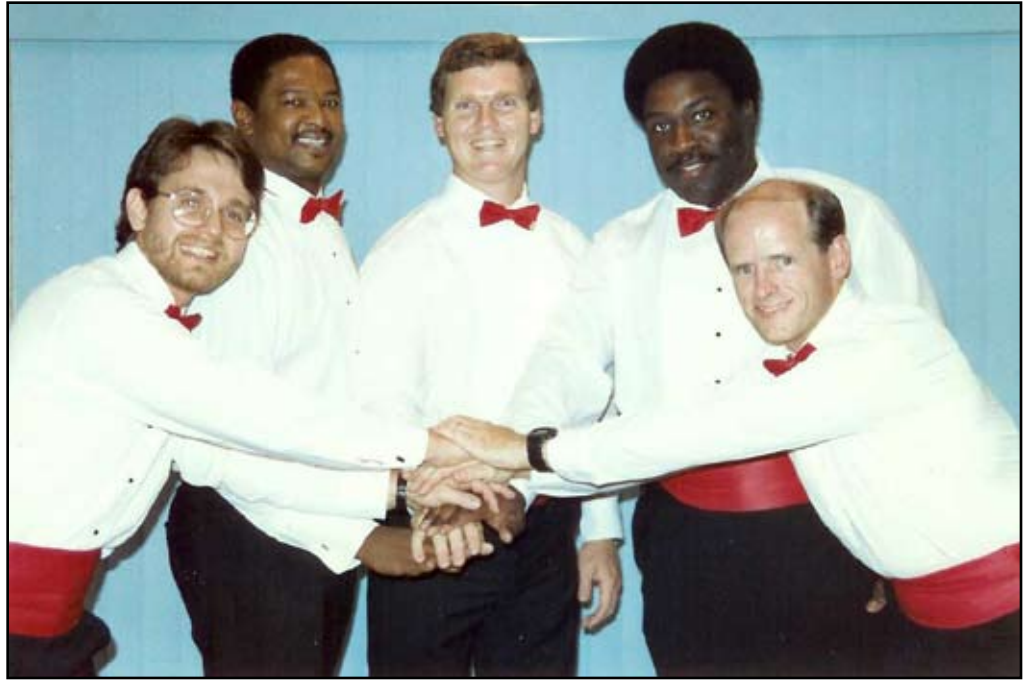
The Brotherhood, pictured as a quintet, will perform as a quartet at NFCC on Oct. 15 at Van H. Priest Auditorium. The performance is part of the NFCC Artist Series' 2009-2010 season.

For more information, visit www.poetryalive.com or contact NFCC College Advancement at (850) 973-1653.