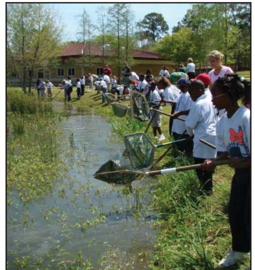
Madison third graders net small pond creatures for observation during Ecology Day.