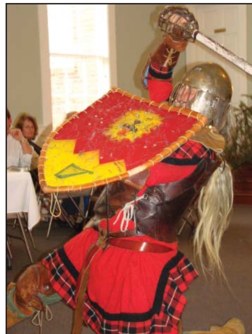
The Incipient Shire of Staggesgate, Society for Creative Anachronism (Valdosta, Georgia) provided Medieval style entertainment Feb. 26.