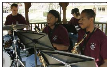
Members of the NFCC Jazz Ensemble provided entertainment for campus guests.