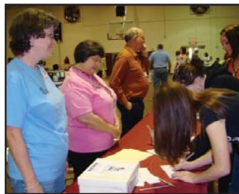
NFCC enrolled 55 students for summer and fall terms during Super Saturday.